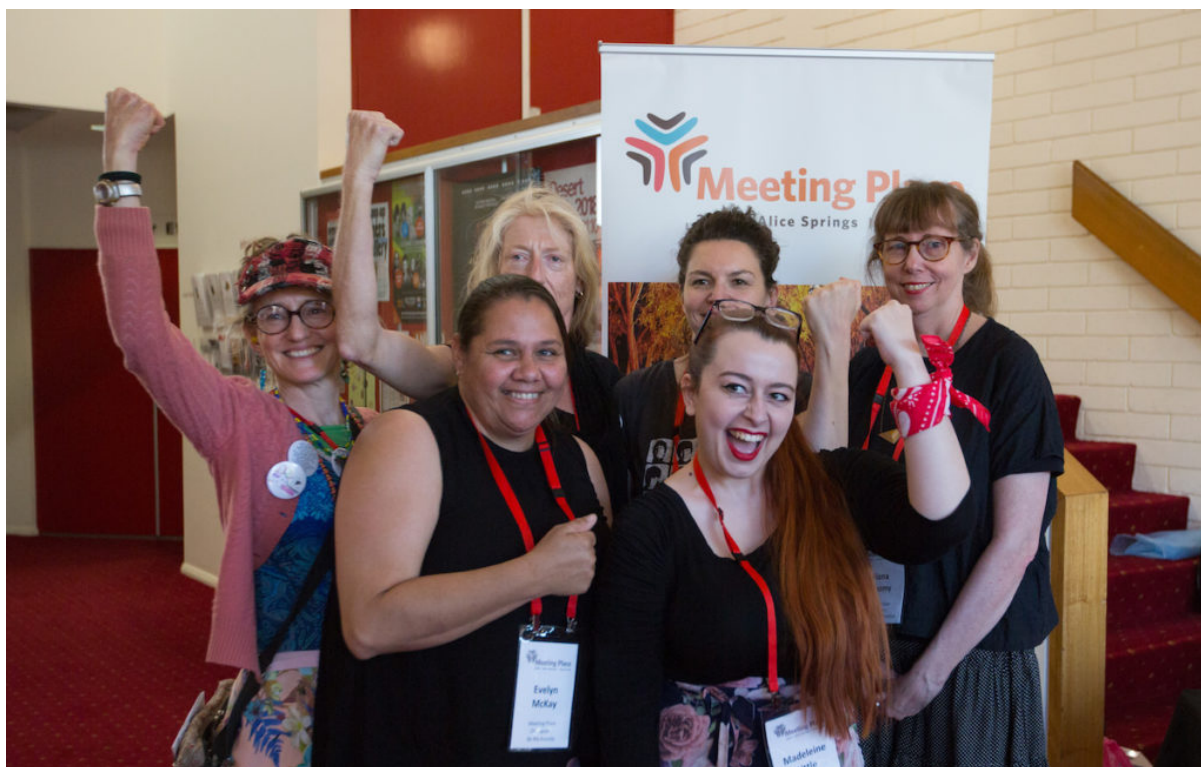
Image title: Meeting Place 2018 Travel Grant Recipients Location: Araluen Arts Centre, Alice Springs