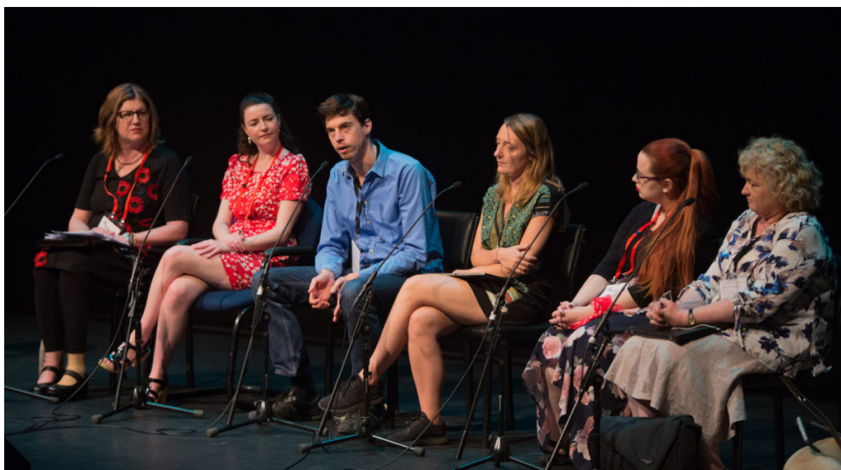
Image title: Leading to the Future Panel members at Meeting Place 2018 Location: Araluen Arts Centre, Alice Springs